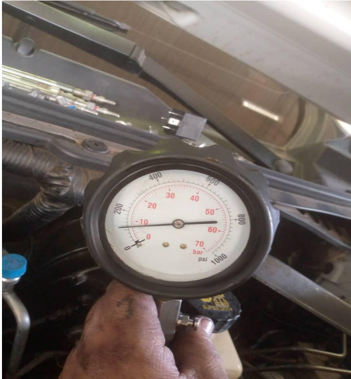
CILINDRO a 3 PSI 120 BAR 9